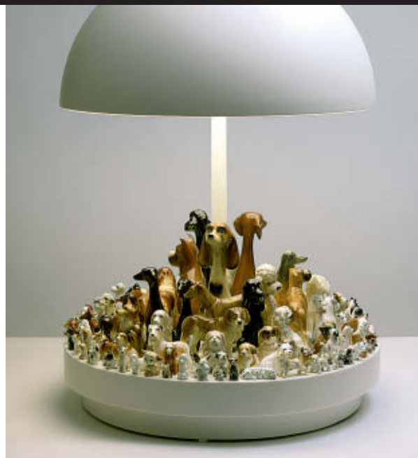
ILLUSTRATION ROB BIDDULPH

Faster than the earth can regenerate vital resources, we are using them up. Upcyclists who take discarded objects or materials and make them desirable again through design and reuse are at the forefront of a battle for hearts, minds and hammers. Antonia Edwards, a former nominee for an Observer ethical award, leads the charge. Her new book, Upcyclist , is organised by materials – wood, textiles, metal, glass and ceramics, paper and plastic, and mixed media – and shows not only how upcycling slows down consumption but also how it can unlock a whole creative process. Prepare to be inspired. To order a copy of Upcyclist for £23.99 (RRP £29.99), go to bookshop.theguardian.com